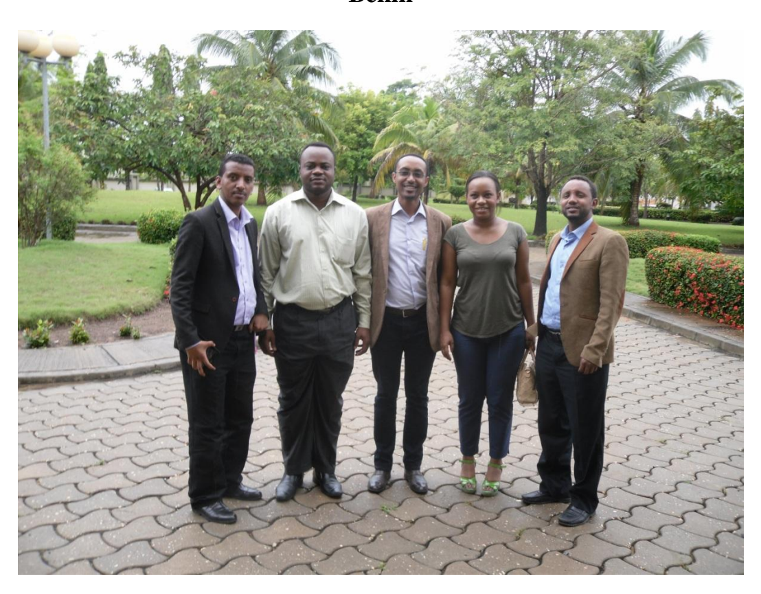
Photo I. Study tour team with LOGIVAC staff members at Regional Institute of Public Health in Ouidah, Benin